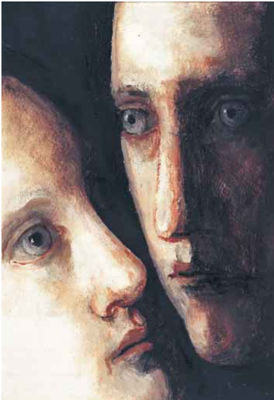
46. Watching You II Oil on paper 21.5 x 14.5 cm, 8½ x 5¾ ins