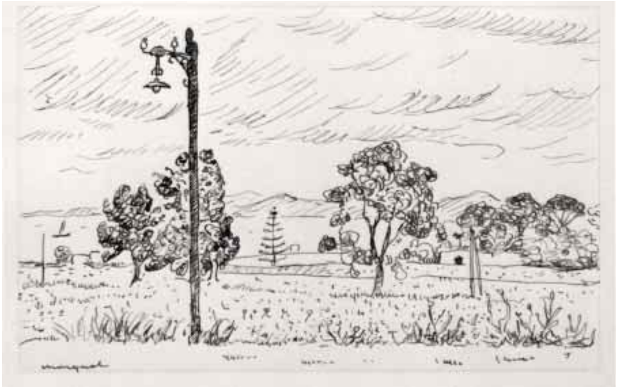
31. Paysage, Côte d'Azur 1930s Pen and Ink 11x 18 cm, 4¼ x 7⅞ ins Signed lower left