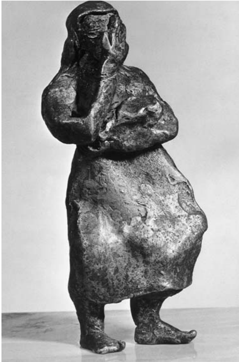
Calabrian Woman , cat. no. 14