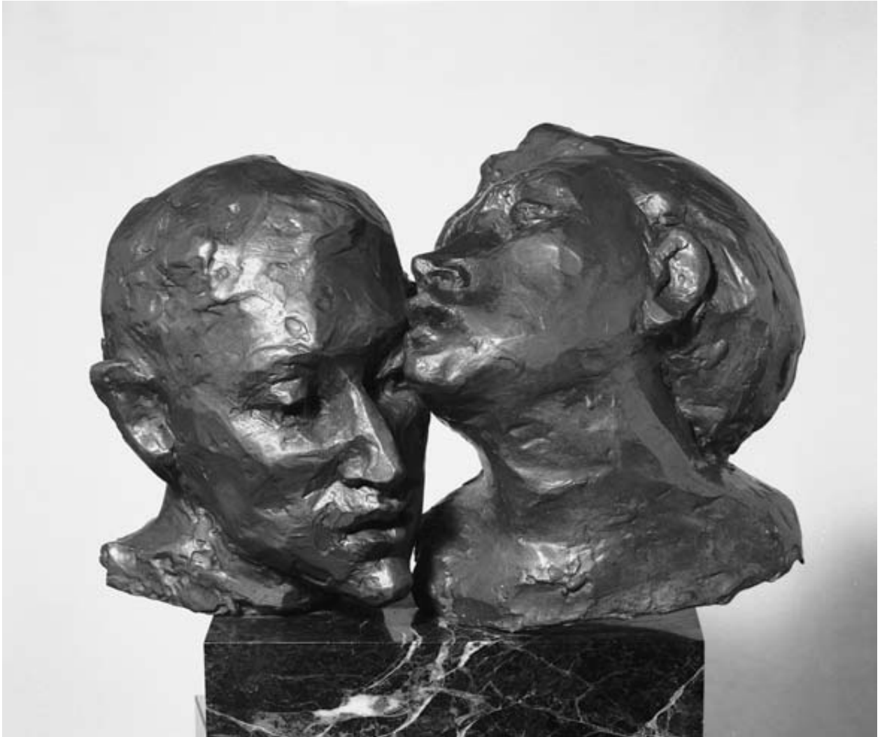
The Last Kiss , cat.no. 9