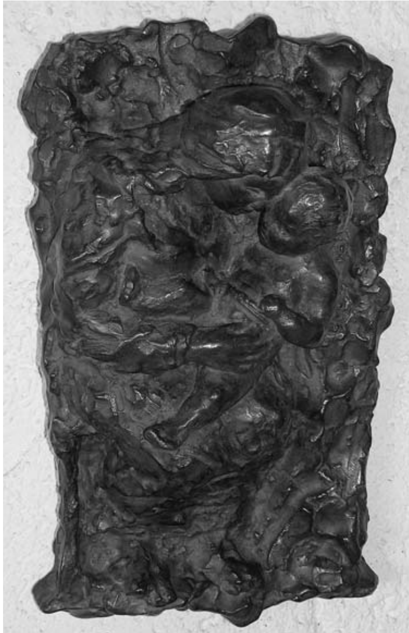
Maternity, cat.no. 28