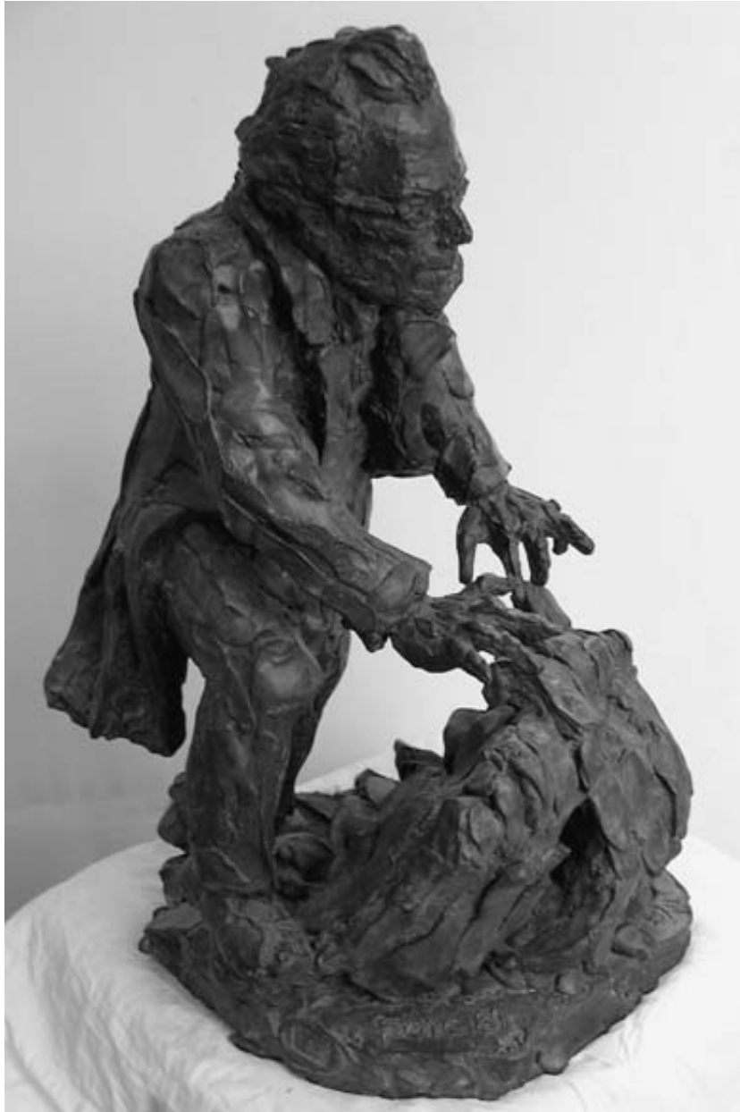
Mahler Playing the Waves, cat.no. 22