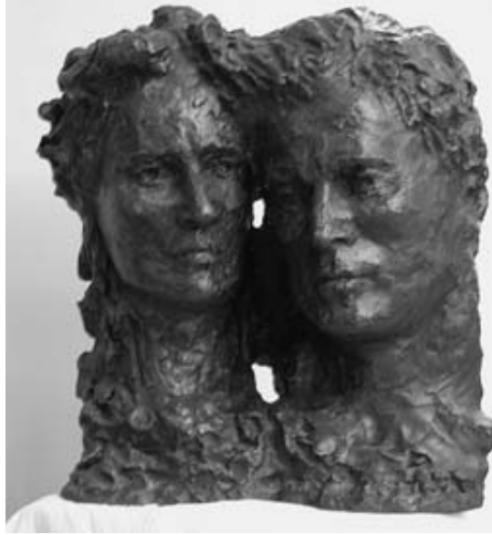
Brother and Sister, cat. no. 26