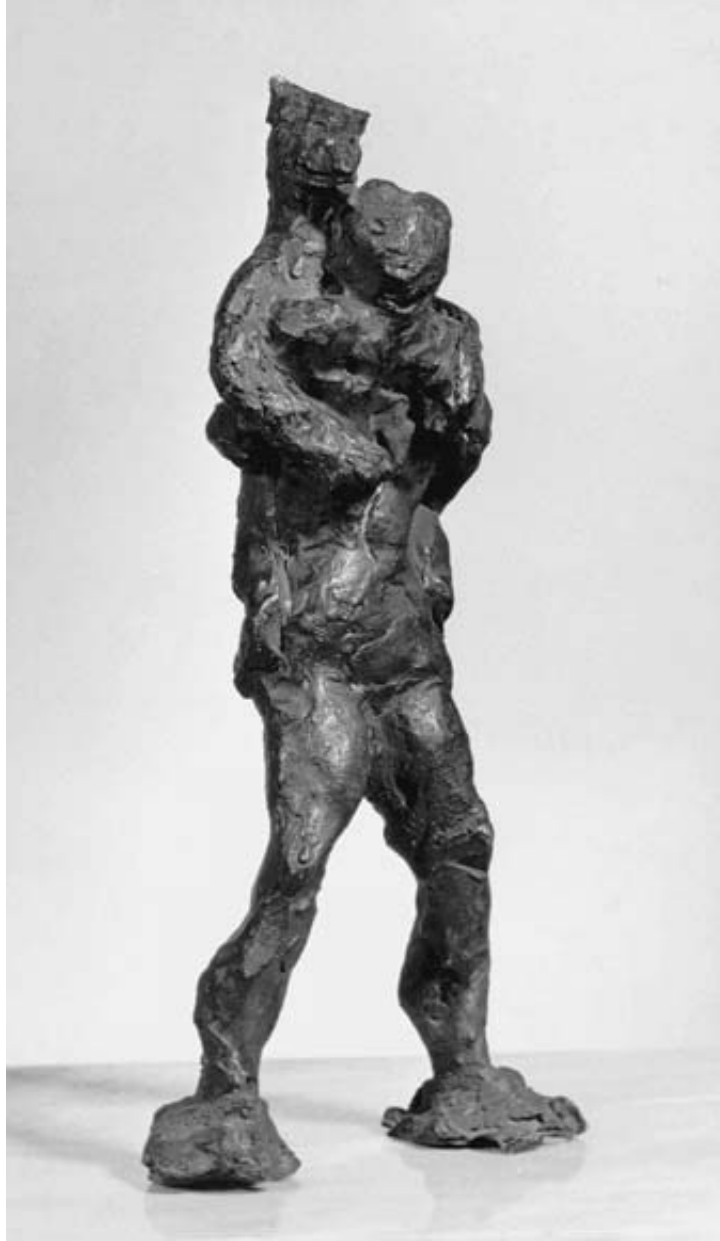
Shepherd and Dog, cat. no. 7